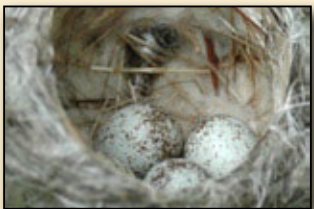
Swamp Sparrow Nest