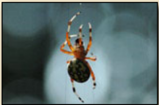
Marbled Orb Weaver Spider