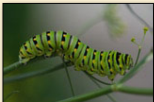
Black Swallowtail Caterpillar